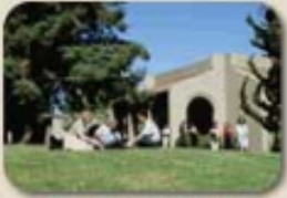
De Anza College